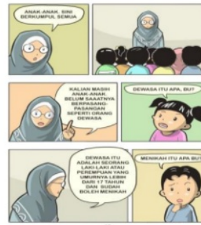
Figure 2. The instruction to use the book