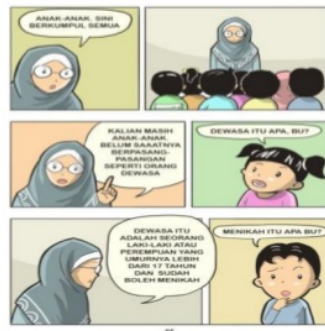
Figure 3 Smart Information

BUSAPAKSA design contained CSA material in story approach. Rahmawati (2012) says that an accurate social story strategy, which describes situations and pure comic conversation by using visual symbols, abstract conversational concept and columns which indicate emotional content, can improve the students' understanding on sexual education. BUSAPAKSA consisted of seven stories, which were as follows: (1) recognizing and maintaining My body parts; (2) Recognizing Family Members; (3) Computer and Internet Learning; (4) Recognizing the Police Offices; (5) Going to the Zoo; (6) Fishing in the River and (7) Being Adult Game